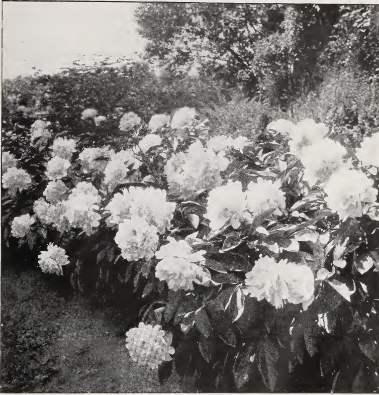
Festiva Maxima Peonies